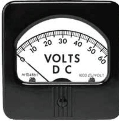
597 - D.C Moving Coil 598 - A.C. Repulsion