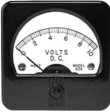
635 - D.C Moving Coil 636 - A.C. Repulsion