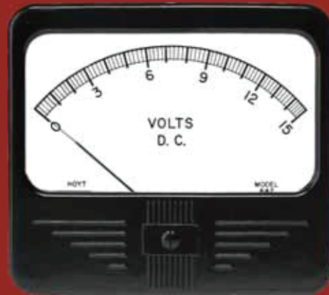
647 - D.C Moving Coil 648 - A.C. Repulsion