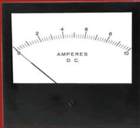
680 - D.C Moving Coil 681 - A.C. Repulsion